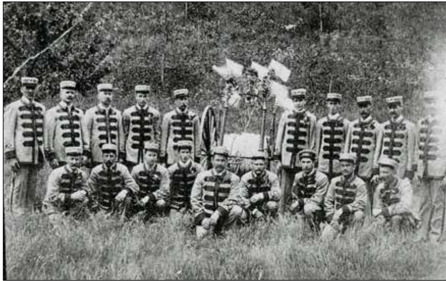
Early Downsville Hose Company members with hand pulled pumper.

first fire hall, the former Henry A. Williams Store lot (currently the Downsville Hardware building) for $1,500. The fire fighting apparatus consisted of hand and horse drawn equipment. The first gasoline powered Chevrolet fire truck, was purchased in 1926 and on June 11, 1946 the company purchased another Chevrolet, its first pumper for $1,800.