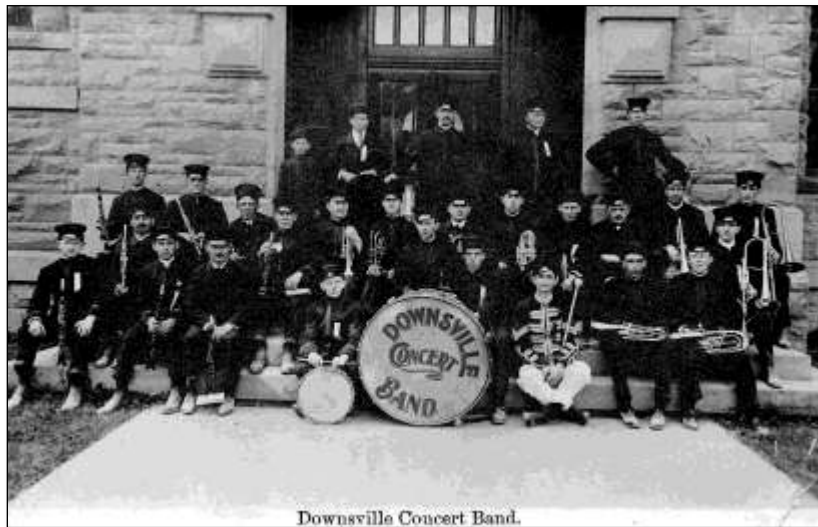
1916 Downsville Concert Band Postcard--in front of Walton Library

Displays March 1-May 15, 2016—Downsville Concert Band. This display in Town Hall will feature photographs, documents and artifacts from the Downsville Military, Cornet and Concert Bands. The first Military Band was organized before the Civil War and was followed by the cornet band and three other community bands from 1865 to 1882. The Downsville Concert Band was organized in April 1884 and continued for over fifty years. The band was a popular social organization that purchased instruments, sheet music and uniforms for all its members. New members were given free instrument instruction by the older members and this insured the continuation of the band.