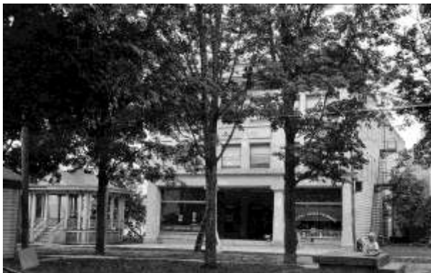
Band Stand and Opera House 1911

Band performances were very popular and their flattering press releases and reputation led to invitations to play throughout Delaware, and Sullivan Counties, as well as, Pennsylvania. The Concert Band did charge performance fees for concerts outside of Downsville and these fees were used for the purchase of instruments, uniforms, music and transportation of the band members to their different events. Stop in at Town Hall and learn more about Downsville Concert Band History.