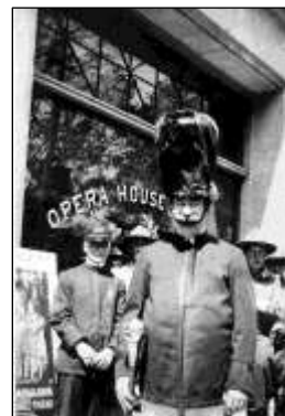
Drum Major 1919