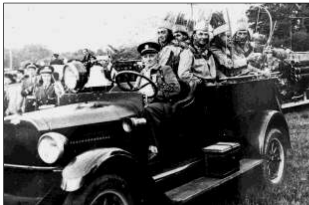
Memorial Day Parade 1946 - First Gasoline 1926 Chevrolet Fire truck with Red Men group, first pumper on right.