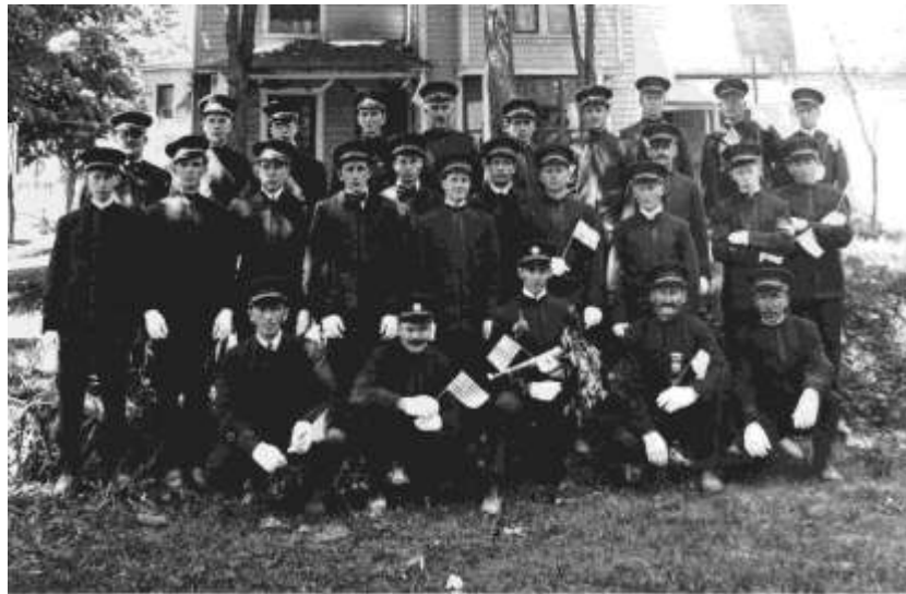
1914 Downsville Fire Department Members