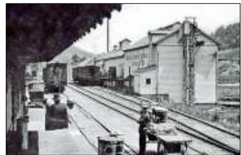
Downsville Station and Borden's Creamery

The "Red Heifer" was a combination 30 passenger and express U.S. Mail car which ran daily from East Branch to Arkville from 1926 to 1942.