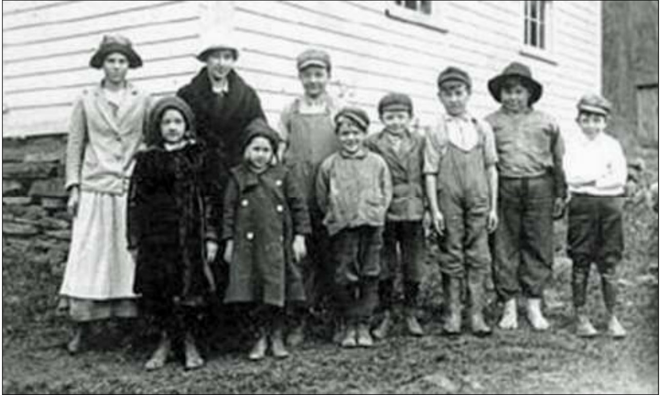
Gregorytown School Group 1903