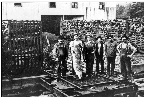
Loading four foot wood for the furnaces