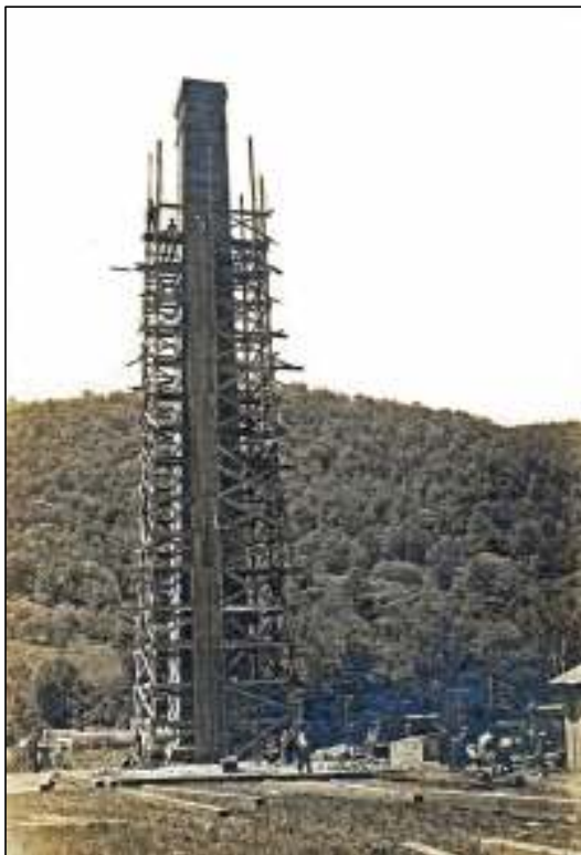
Acid Factory Chimney construction 1912