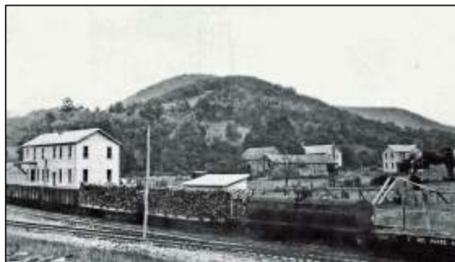
"Dinkey Engine" used in the wood yard